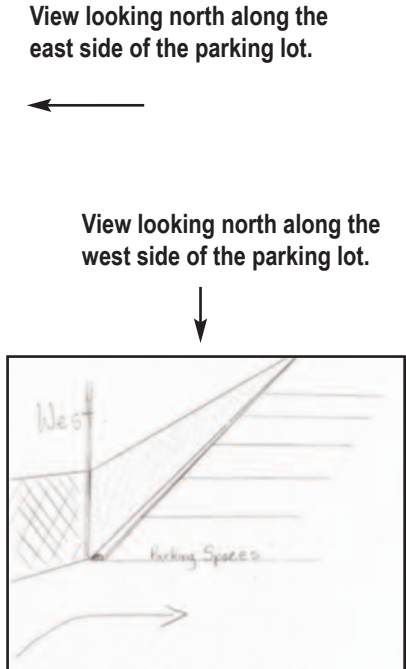
Place of Meeting page 6